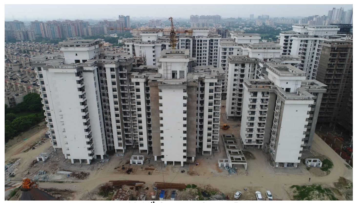
In Block B-03 11<sup>th</sup> floor Roof slab 75% casted. 12<sup>th</sup> floor columns casting is in progress.